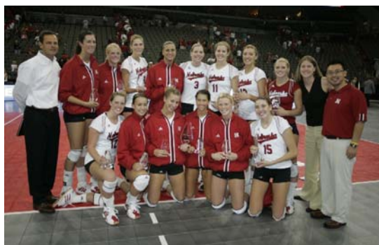
The 2007 Nebraska team began defense of its national championship with a Showcase championship.

10 Times the Defending NCAA Champion has Participated in the Next Year's Showcase