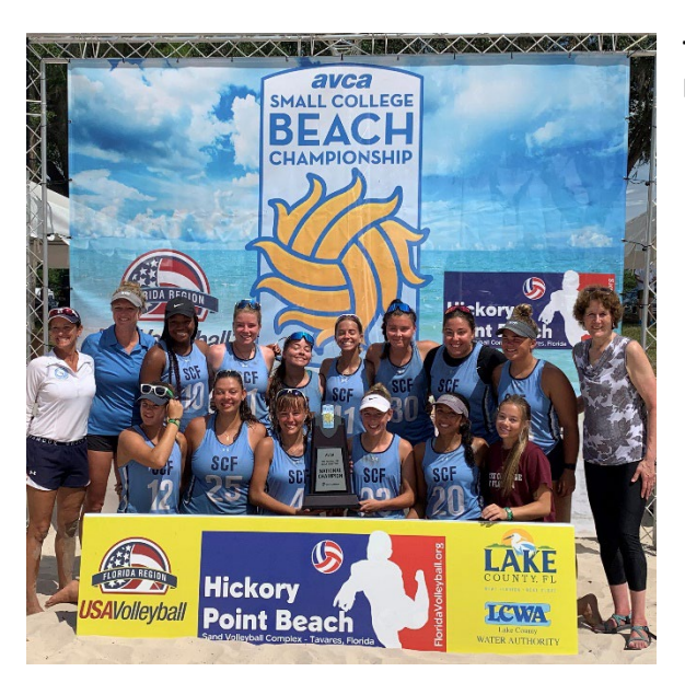
Two-Year College National Champions - State College of Florida